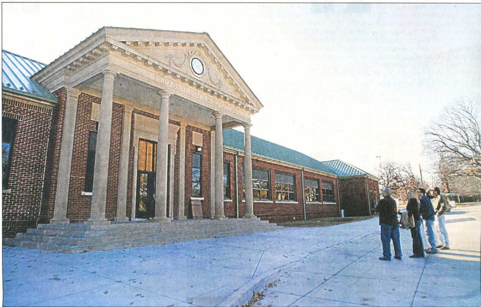
School and construction officials gather outside the renovated Porter Early Childhood Development Center during a tour last month.