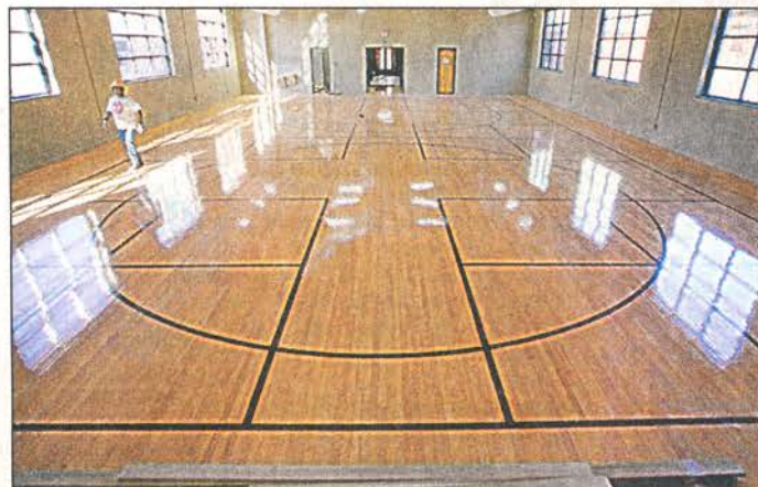
A worker walks through the gym at the renovated Porter Early Childhood Development Center recently.